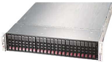
Vi-8810L Stand-Alone DASD

The Vi-8810L Mainframe DASD is designed to provide a high performance, cost effective solution for both small and enterprise size environments.